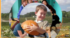
15th Anniversary Video

"I can attest to the fact that my child knows the day of the week the Cart comes around and it is truly something he looks forward to. Being in the hospital for weeks at a time, there are only a few moments these kids look forward to and the Mattie Miracle Cart has achieved just that!" ~ MedStar Georgetown Hospital Parent